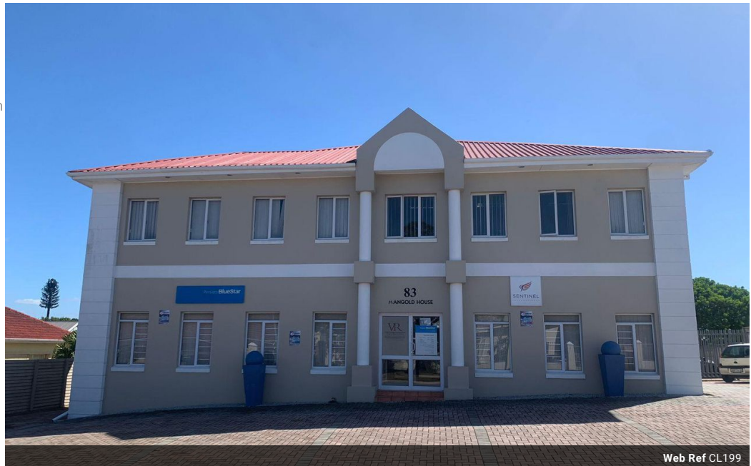
Web Ref CL199

43B - 6th Avenue Walmer Port Elizabeth 6070