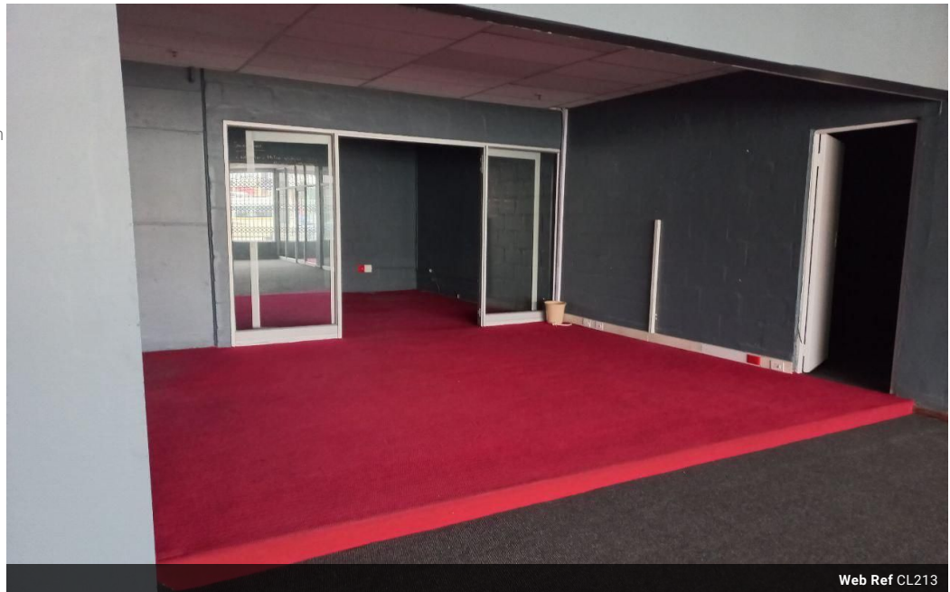
Web Ref CL213

43B - 6th Avenue Walmer Port Elizabeth 6070