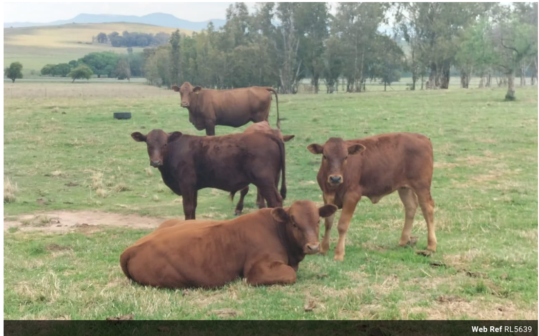
Web Ref RL5639

Shop 26 Pretty Gardens Langenhoven Park Bloemfontein