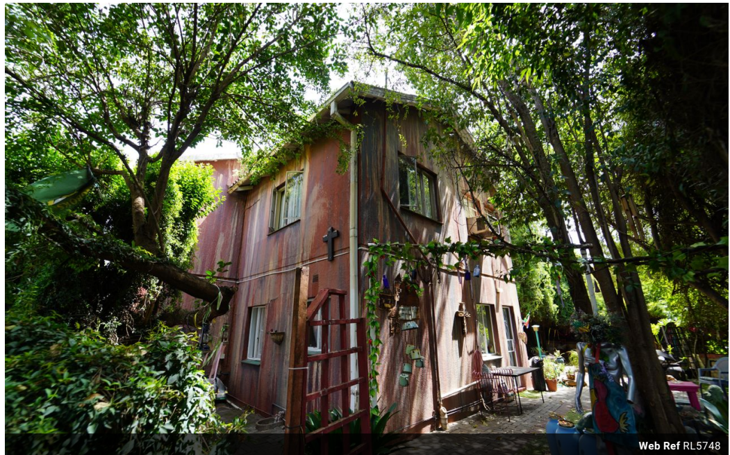
Web Ref RL5748

Shop 26 Pretty Gardens Langenhoven Park Bloemfontein