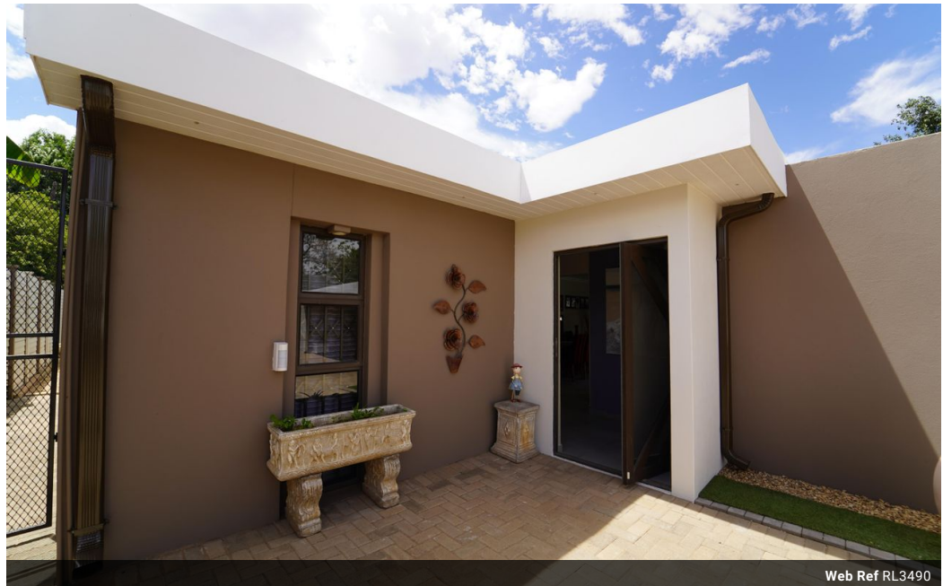
Web Ref RL3490

Shop 26 Pretty Gardens Langenhoven Park Bloemfontein