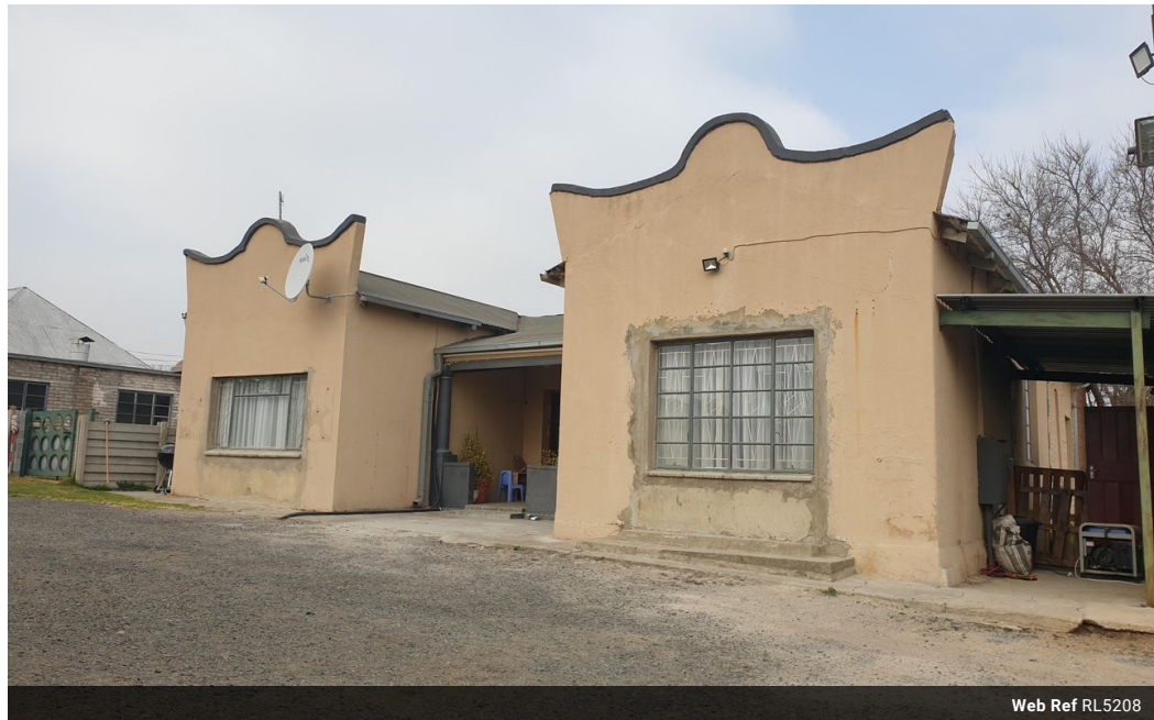
Web Ref RL5208

Shop 26 Pretty Gardens Langenhoven Park Bloemfontein