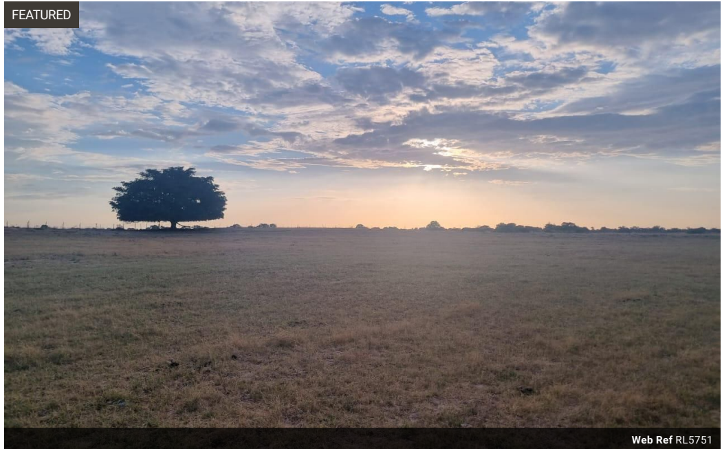
Web Ref RL5751