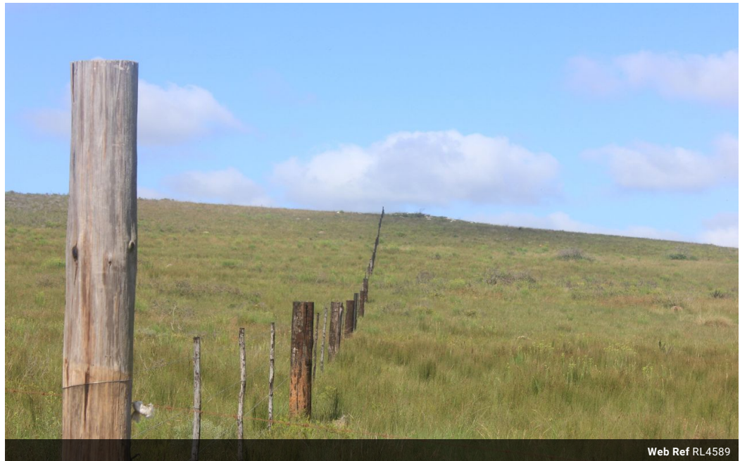
Web Ref RL4589

43B - 6th Avenue Walmer Port Elizabeth 6070