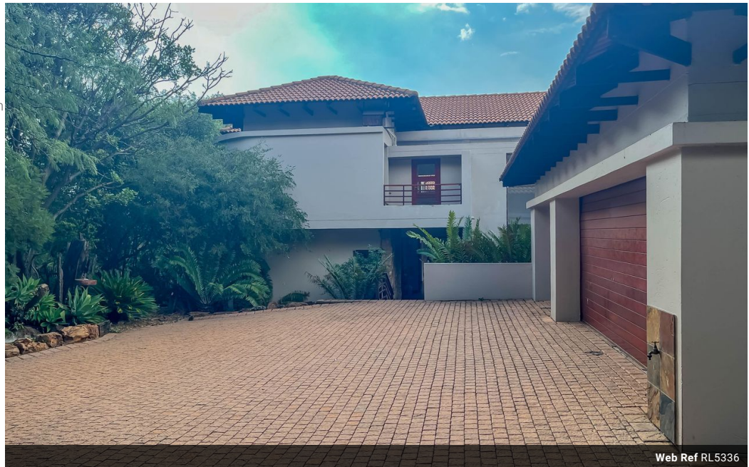
Web Ref RL5336