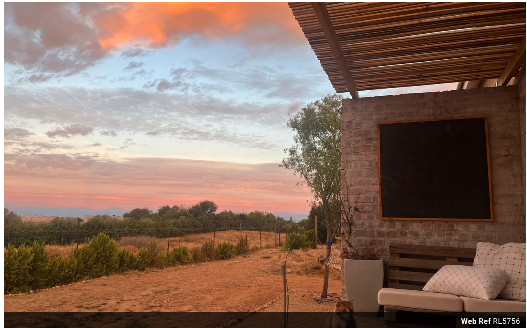
Web Ref RL5756