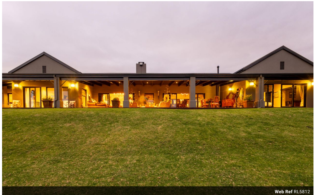
Web Ref RL5812

43B - 6th Avenue Walmer Port Elizabeth 6070