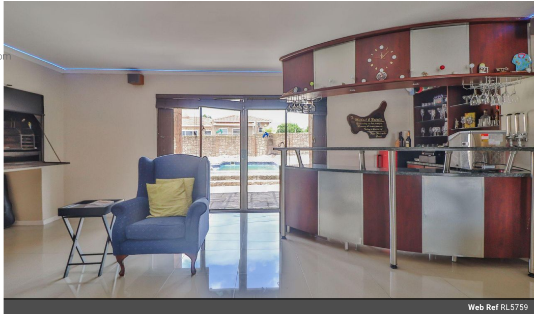
Web Ref RL5759

43B - 6th Avenue Walmer Port Elizabeth 6070