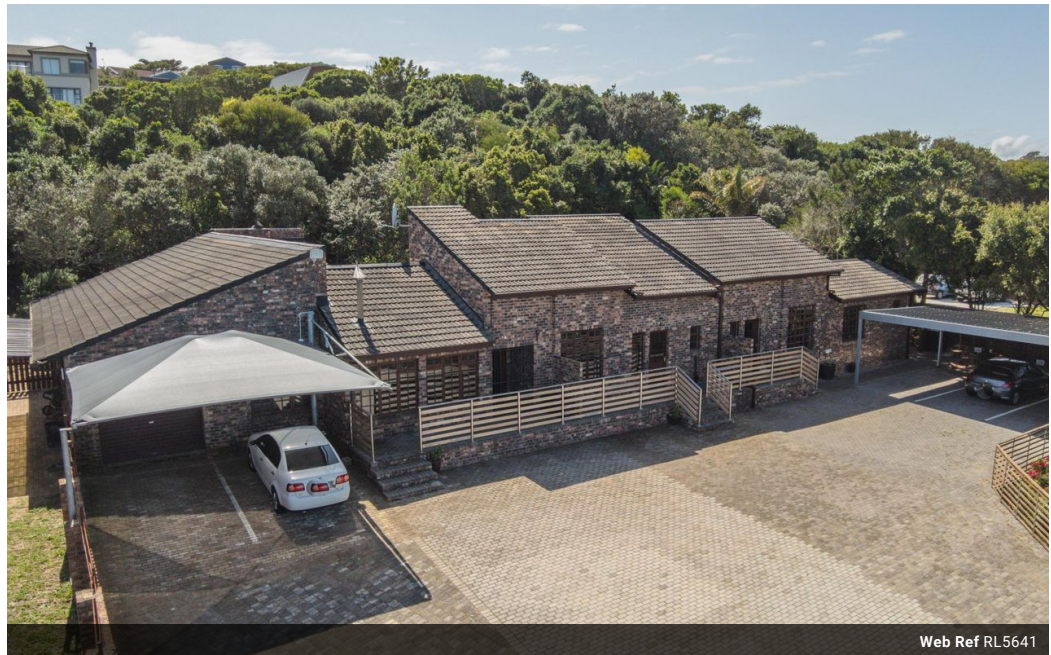
Web Ref RL5641

43B - 6th Avenue Walmer Port Elizabeth 6070