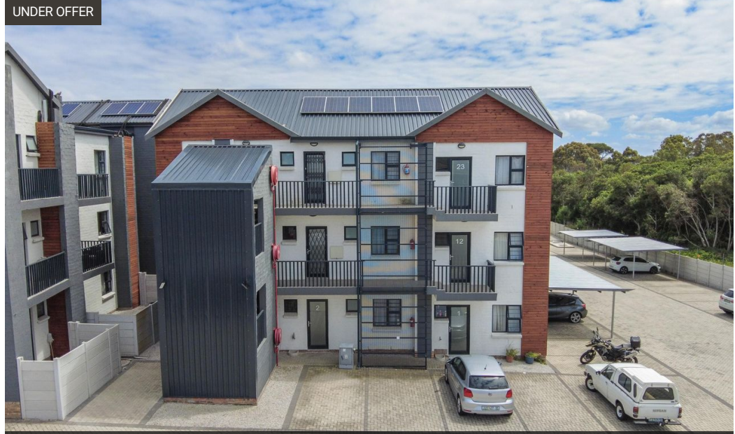
SOLE MANDATE Web Ref RL5766

43B - 6th Avenue Walmer Port Elizabeth 6070