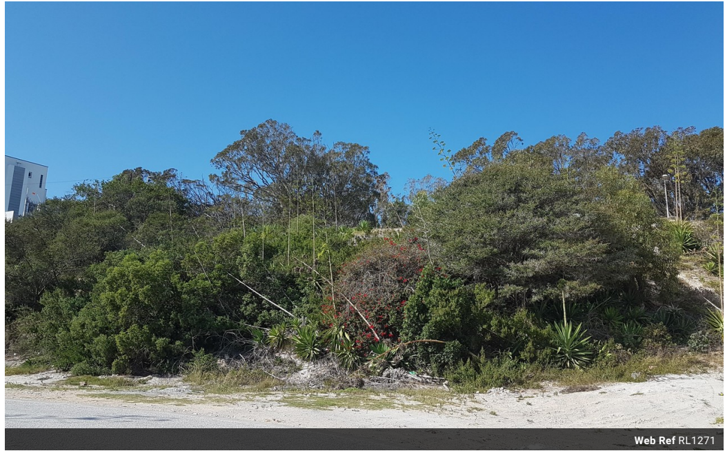
Web Ref RL1271

43B - 6th Avenue Walmer Port Elizabeth 6070