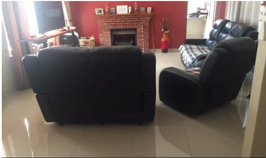
Web Ref RL5435