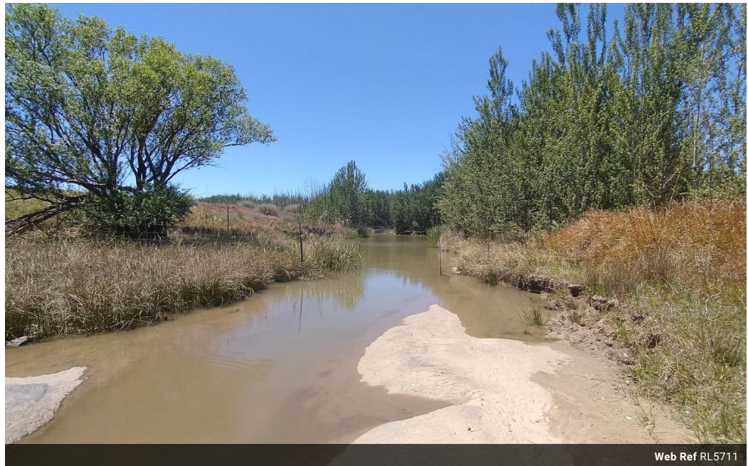
Web Ref RL5711

Shop 26 Pretty Gardens Langenhoven Park Bloemfontein