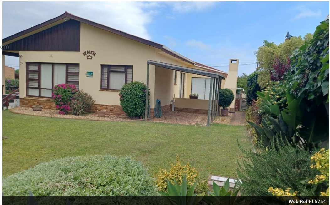
Web Ref RL5754