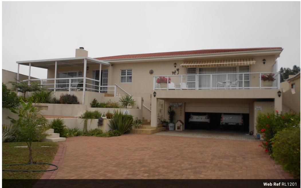
Web Ref RL1201