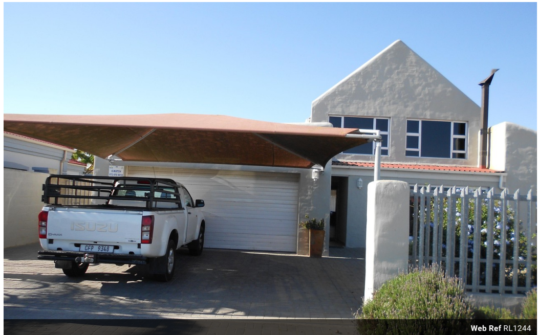
Web Ref RL1244